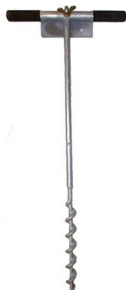
Rod Screw DJS 1 For temporary grounding