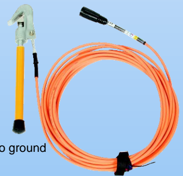
1-Phase Earthing Device JSKL1-JTG Recommended as down line to ground When working without "0" line Line length: 15 m Pole length: 0,3 m