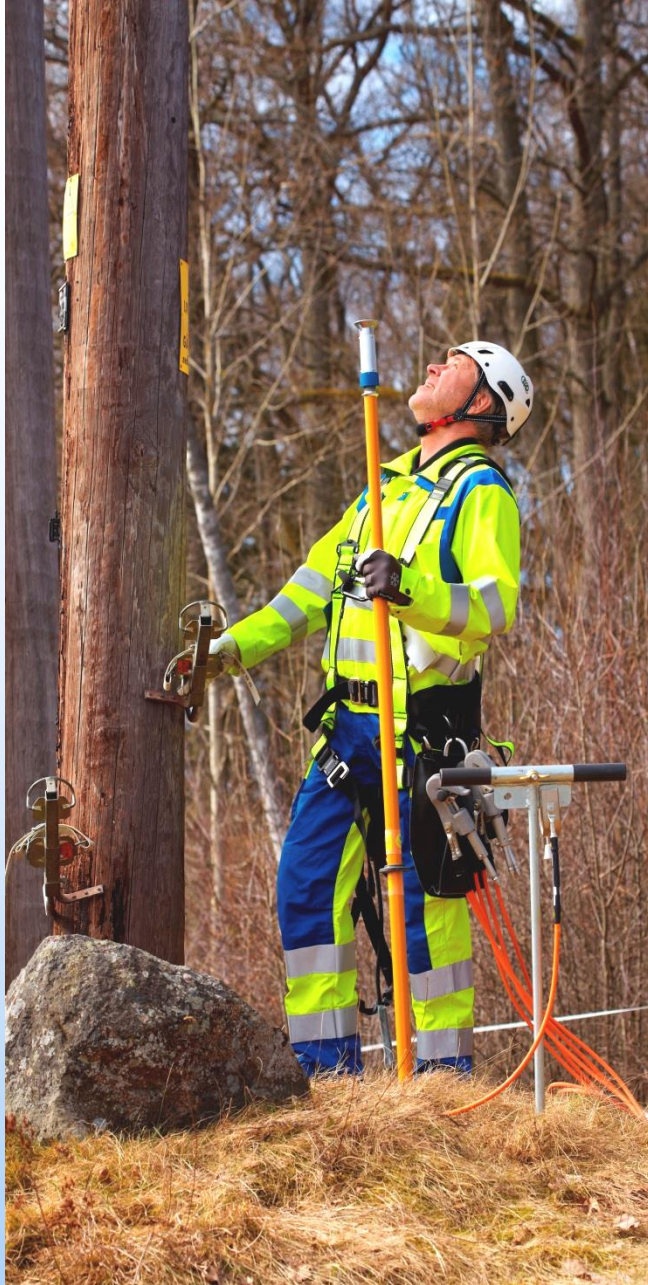
3-Phase Earthing Device JSKL3-STG Low- and high voltage 0,4 – 52 kV max 16,0 kA/1s