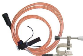
1-Phase Earthing Device JK238-DXF Suitable as down line to earth when there is no "0" conductor. The device is for connection to framework up to 30mm thick.