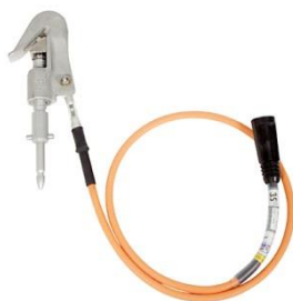
1-Phase Earthing Device JSKL1-STG Line length: 1,5 m

The Line Clamp JSKL-STG is equipped with buttress thread, which makes the tightening with only few turns.