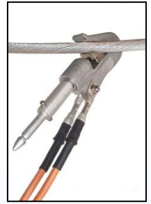
The clamp can be fitted in inclined angle to the line!